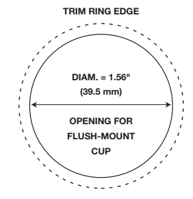
Figure 2. Use this template to flush-mount a Kappa10.1t tweeter.